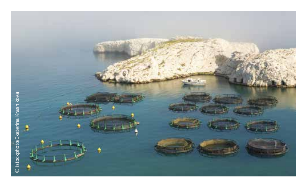
Aquaculture employs around 65 000 people in the EU.

The fund helps achieve the ambitious objectives of the common fisheries policy. As the Commission relieves pressure on the stocks and leave them time to recover, the communities depending on fishing need support in coping with the transition and in supplementing their income. The fund helps operators to modernise their way of fishing, find ways to add value to their catches or find alternatives to fishing: for example they may choose to replace their nets with more selective ones in order to reduce by-catch or to develop new technologies that could lower the impact of fish farming on the environment.