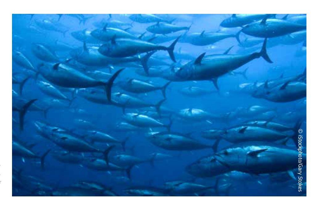
The EU is a member of the International Commission for the Conservation of Atlantic Tunas.

A sea-basin strategy places EU administration, national governments, local authorities, operators, industry and non-governmental organisations (NGO) on a par, as partners in ensuring coherent outcomes that benefit their people and their environment. This does not need any extra money: it is simply a mechanism to ensure that existing funds are spent consistently and within a long-term framework, so as to guarantee better and multiplied effects. In other words, it is a form of smart management.