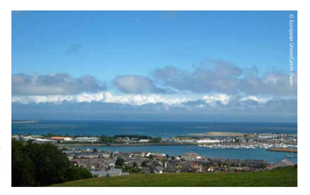
The European Maritime and Fisheries Fund will help improve the quality of life along Europe's coastal regions.