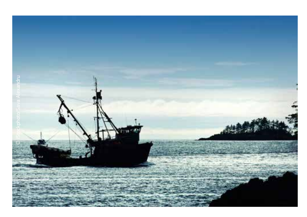
There are almost 100 000 fishing boats in operation around Europe.