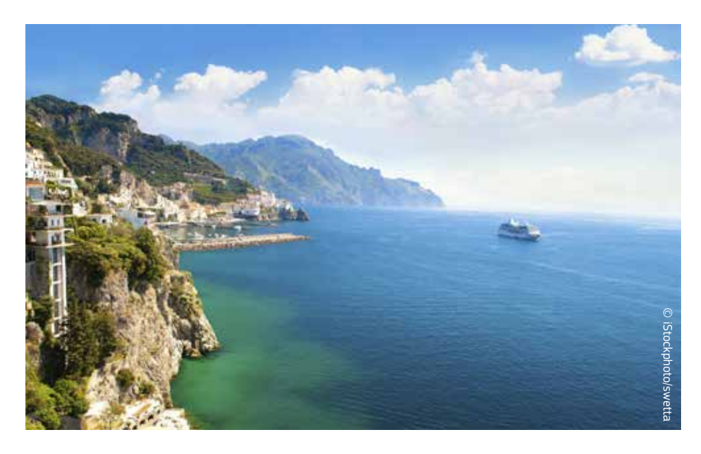
Europe's 'blue economy' contributes over 5 million jobs to the economy.