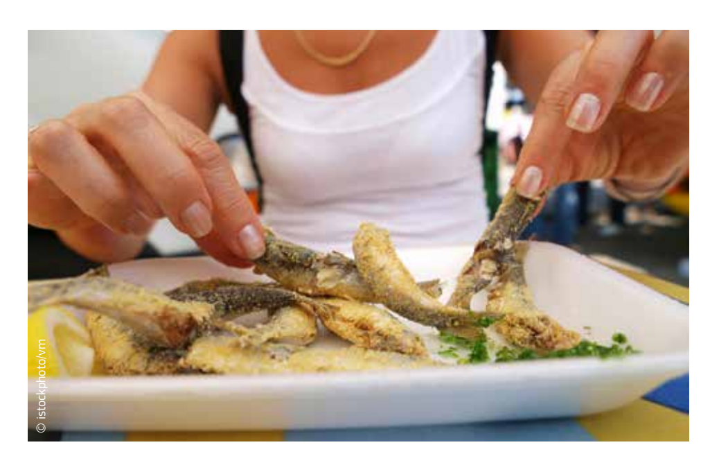
There is an ever-increasing demand for seafood.

The European Maritime and Fisheries Fund is worth €6.5 billion. This fund replaces the existing European Fisheries Fund and also groups a number of other ancillary funds into a single instrument. Red tape has been cut so that beneficiaries have easier access to capital.