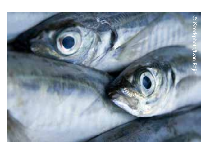
The EU promotes sustainable fisheries.

The Commission has made it a priority to improve our knowledge not only on the state of stocks (indispensable for any management decision), but also on the sea in general: its depths, its living organisms, its sediments and currents and so on. It is creating the conditions for all surveillance authorities to share data in real time, so as to improve rescue operations and the fight against crime. And the Commission has created a legal framework for EU countries to plan their use of sea space or multiple uses of the same space.