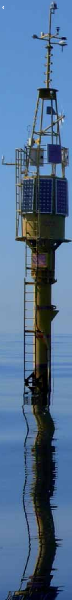
The open ocean observatory ODAS Italia 1 moored in the Ligurian Sea and managed by the National Research Council of Italy