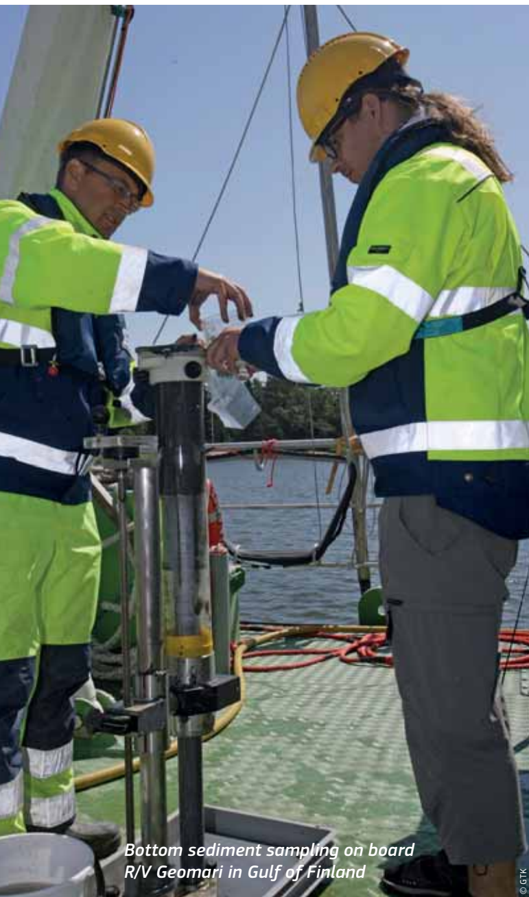
Bottom sediment sampling on board R/V Geomari in Gulf of Finland