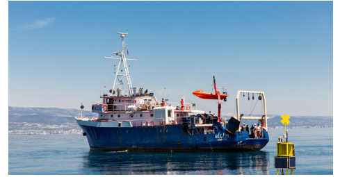
© Orta Doğu Teknik Üniversitesi / Middle East Technical University