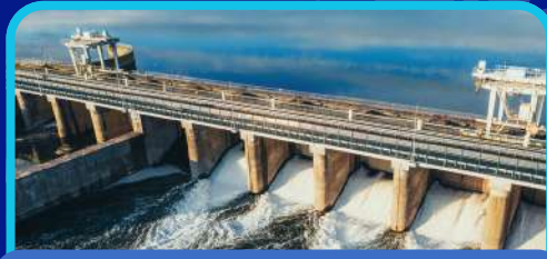
A competitive, innovative and sustainable blue economy