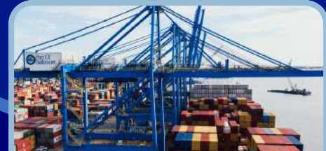
Fostering investment in the Black Sea blue economy