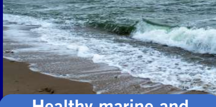
Healthy marine and coastal ecosystems